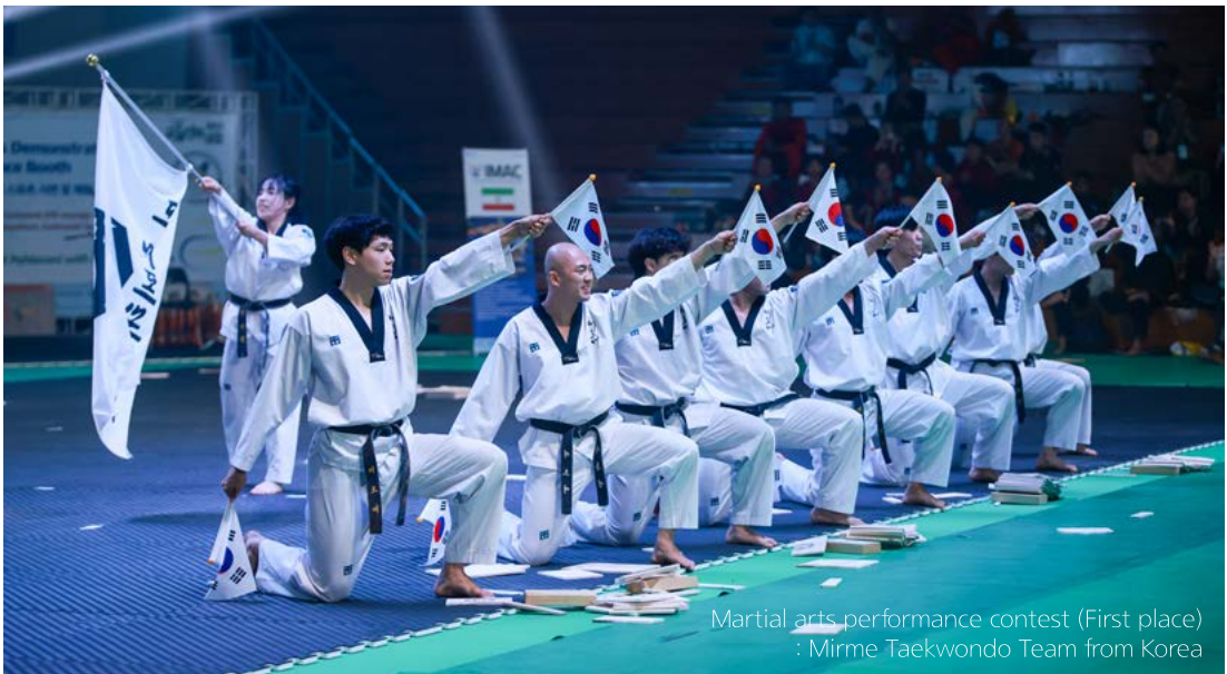
Martial arts performance contest (First place) : Mirme Taekwondo Team from Korea

Continuing the structure of the 2nd generation International Martial Arts Contest held the previous year, this edition included both martial arts II, which emphasized traditional martial arts performances, and martial arts I, which concentrated on martial arts training. This encompassed the “Competition for Youth Martial Arts & Fitness Certification,” aiming to prove the impact of martial arts on the growth and development of youth through objective data.