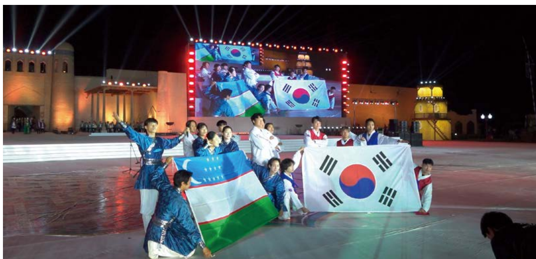
September 8, 2023 – Joint performance at the opening ceremony by Team Korea Taekkyeon

The opening ceremony of the International Ethno Sports Festival in Khorezm, Uzbekistan featured a remarkable performance by Team Korea Taekkyeon, a collaboration between the Kyulyun Taekyun Association, the Korea Taekkyon Federation, and the Chungju City