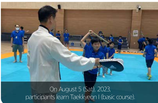
On August 5 (Sat), 2023, participants learn Taekkyeon I (basic course).