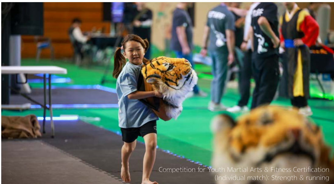
Competition for Youth Martial Arts & Fitness Certification (Individual match): Strength & running