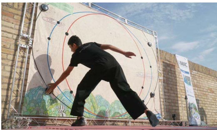
September 9, 2023 – Measurement of hand techniques for Uzbek Martial Arts Fitness for Youth

Taekkyeon Team. This special presentation, witnessed by an audience of 10,000, was a historic moment as it marked the first-ever joint performance by these three major entities in the history of Taekkyeon during an overseas event. The media and prominent figures, including the Minister of Youth Policy and Sports of Uzbekistan and the President of the World