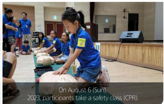
On August 6 (Sun), 2023, participants take a safety class (CPR).