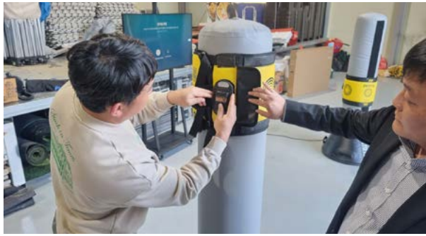
Receiving instruction on how to operate the equipment of the Youth Martial Arts Fitness Certification

Joseon Dynasty and traditional Korean games, integrating them with digital technology. The incorporation of four core disciplines, such as “hand techniques,” “foot techniques,” “weapon techniques,” and “strength & running,” forms the